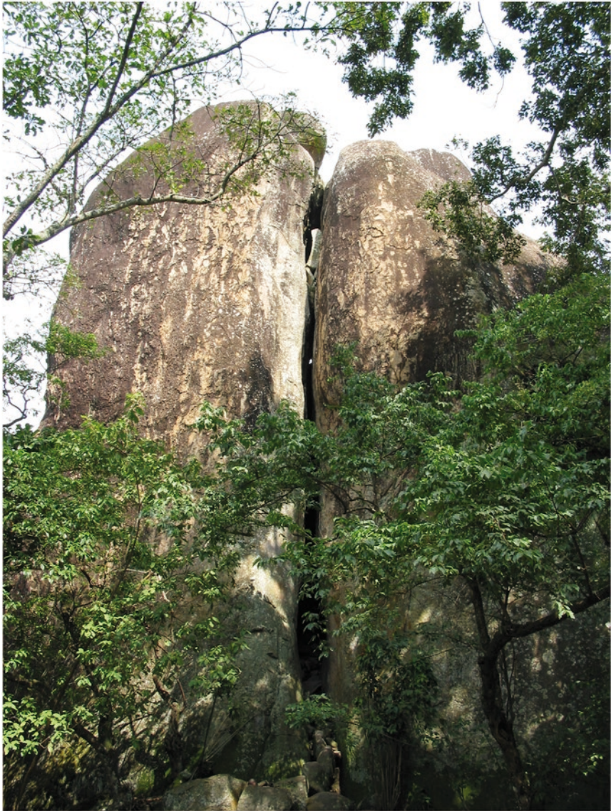
Figure 1. Kkungu rock, 2010.

believed that he had supernaturally appeared from the island of Bukasa without the assistance of humans. 70 In the context of Kibuuka Kigaanira's work among the rocks, the story seems to elicit the significance of twinship (or public blessing) with the prophet's fluid and dynamic relationship with